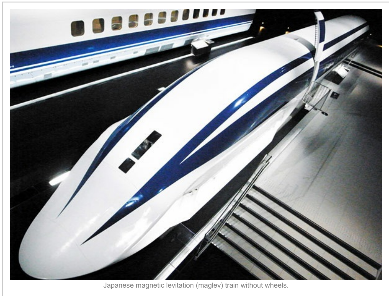
Japanese magnetic levitation (maglev) train without wheels.

As usual, reality offers us two choices. We can look the other way and take a nap on the comfortable cushion of national pride. Typical of that approach was an article published by the French daily Le Figaro on December 27 reporting the Japanese decision to invest 32 billion euros in a Maglev line linking Tokyo to Nagoya (290 km) planned to be operational as of 2025.