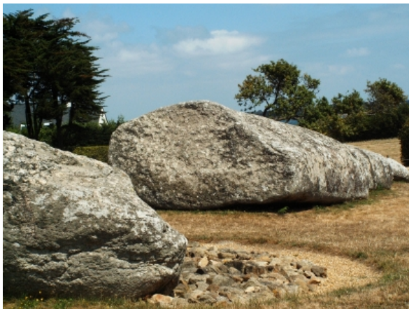
Figure 1 : Er Grah menhir, Mobihan, France. 25m long and weighting 280 tonnes, it's the heaviest Western European megalith.

Whether the city of tomorrow or some ancient city re-emerging from its slumbers, whether the prompt satisfaction of the enormous logistical requirements that water supply, agriculture, energy or transport call for - the megalithic causeway provides a simple way of bringing to the very site all manner of perfectly operational equipment. Hitherto available only to mining- and petroleum-extraction installations or to populations next the sea and great rivers, that privilege will soon lie before the landlocked ! And this new heavy-transport system will mean a fundamental shift in the balance of power on this earth.