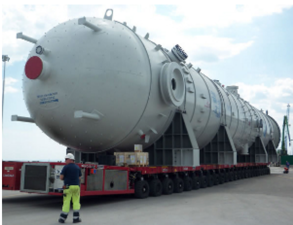
Figure 2 : A chemical industrial reactor ready to move. It's several hundred tonnes on wheels.

As we have shall use the term here, megalithic causeway refers to a very broad road, over which giant transport units can travel, units ranging from hundreds to tens of thousands of tonnes.