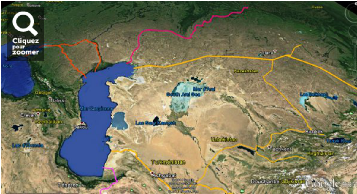
Figure 19 : a network of CML in the heart of Asia

temperature swings, in these regions such equipment must frequently be replaced.