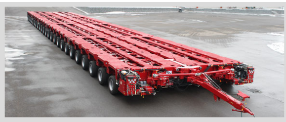
Figure 7 : Typical platform trailers.