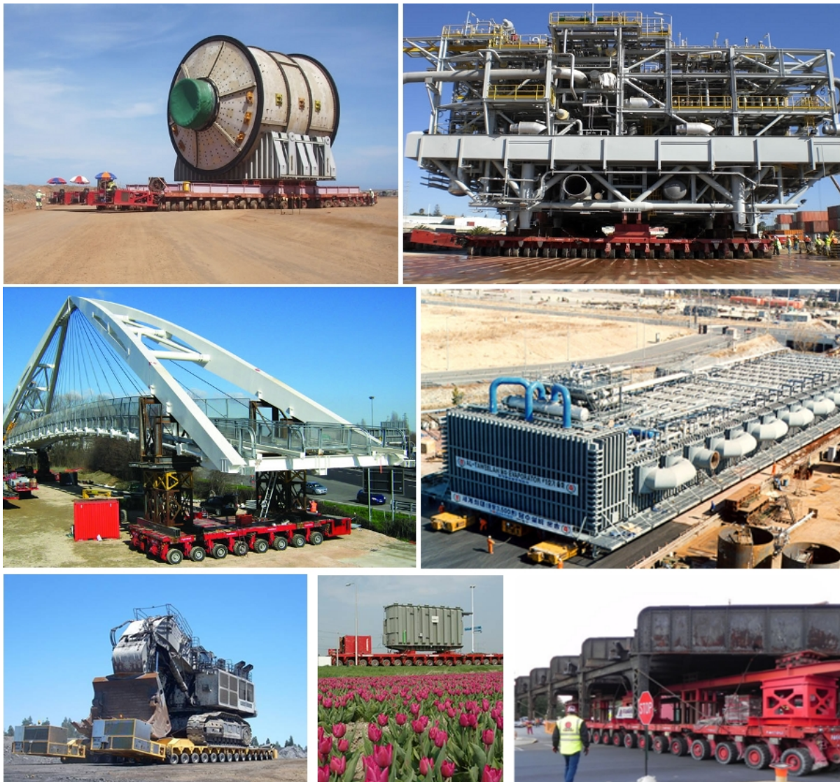
Figure 5 : Several examples of giant objects weighing each several thousand tonnes.

The other application has to do with technological change. Whenever a technology evolves, the production site concerned has to be restructured top-down. Often the earlier installations will simply be abandoned and the workers fired. Does wisdom not dictate bringing onto site preassembled, modern factory parts, to ensure a transition both to new technologies along with new, more advanced jobs ?