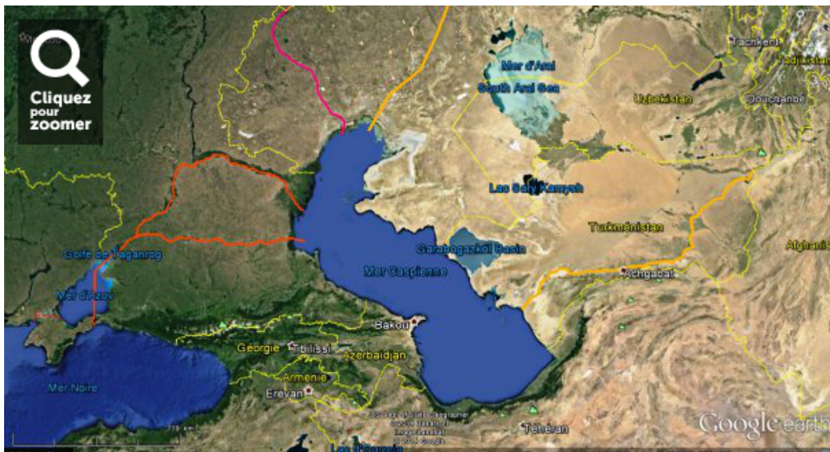
Figure 18 : Turkmenistan CML

Eastward from the Caspian Sea, the Karakum CML, in dark yellow, will connect the sea to Ashgabat, Turkmenistan's capital. An ecological purpose is also intended : replacing the Karakum Canal, which takes too much of Amu Darya River water for intensive cotton production. The Aral Sea is thus becoming a salty lake. The CML will provide a better navigation service and save the Sea at the same time. Westward, the orange link between the Caspian Sea and the Black Sea, leading to the Mediterranean Sea. Two options are represented by two lines, one of which shall be maintained.